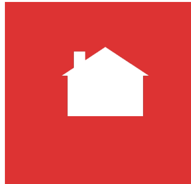
Who We Are