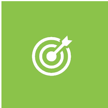
Where We're Going