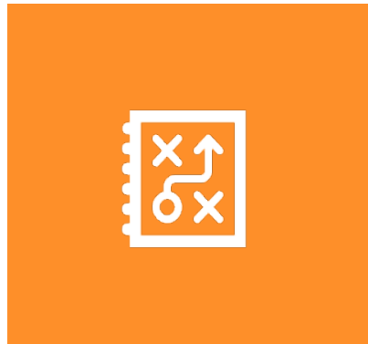
How We'll Get There